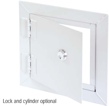
Lock and cylinder optional