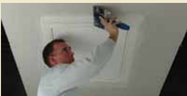
4. Tape and apply drywall compound.